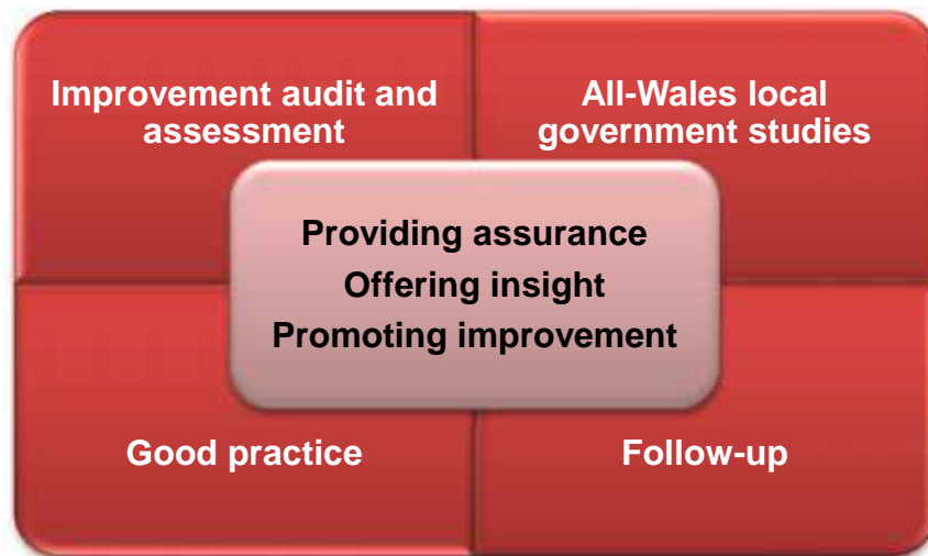
Exhibit 7: Components of my performance audit work

28. The performance work I propose to undertake is summarised in Exhibit 8 on page 12.